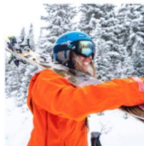
SKI & RIDE COPPER