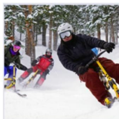
SNOW BIKE RENTALS