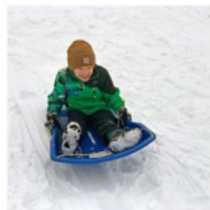
GREEN ACRES SLEDDING HILL